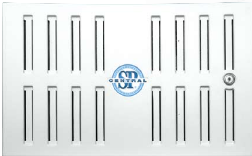
Desktop Server (Rackmount option also available)

SP Central Workflow System provides barcode safety and controls to promote increased dispensing accuracy. The system stores prescription processing data and electronic signatures for prescription dispensing. HIPAA compliance forms are provided as system reports and electronic signatures are available for form acknowledgement, supporting fast and reliable retrieval of information. SP Central Expanded Server can also be configured to support image storage and data backup functionality.